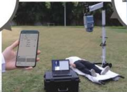
Mobile controls exposure through WiFi